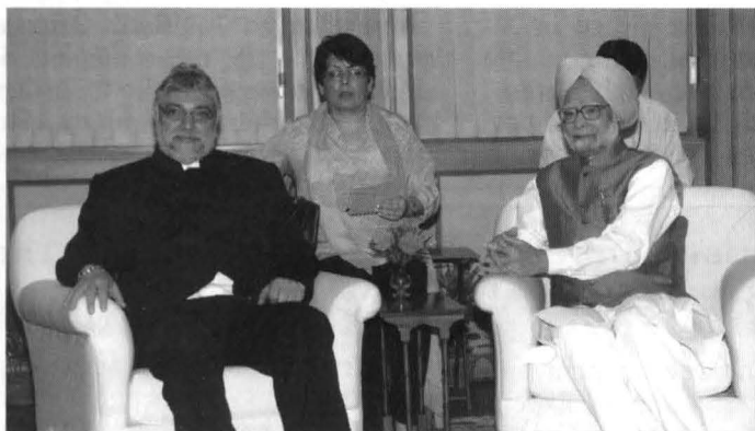
Indian Prime Minister Manmohan Singh with the President of Paraguay Fernando Armindo Lugo Mendez in New Delhi.