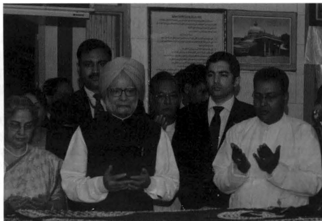
Prime Minister Manmohan Singh offers his prayers at the Mazar of the last Mughal Emperor of India, Bahadur Shah Zafar in Yangon on May 29, 2012.