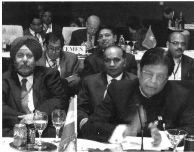
Indian Minister of State for External Affairs, E Ahamed addressing the XVII NAM Ministerial Meeting in Sharm El Sheikh on May 9, 2012.