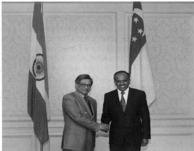
Indian Foreign Minister S M Krishna with K Shanmugam, Minister for Foreign Affairs and Minister for Law of Singapore in New Delhi on May 8, 2012.