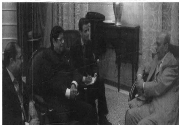
E Ahamed with Foreign Minister of Yemen, Dr Abu Bakar Abdullah al Qirb on the sidelines of Friends of Yemen meeting in Riyadh on May 23, 2012.