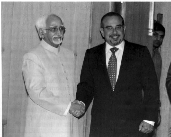
Vice President of India, Hamid Ansari with Salman Bin Hamad Al-Khalifa, Crown Prince and Deputy Supreme Commander of the Kingdom of Bahrain in New Delhi on May 31, 2012.